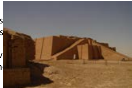
The ziggurat at Ur built around 2100BC. The ziggurat is the most distinctive architectural invention of the Ancient Near East.

Sometime around 3000BC, on the flood plain of the Tigris and Euphrates rivers, Ancient Sumerian culture began to thrive. The area, also known as Mesopotamia (meaning 'between two rivers in Greek) made it a good place to settle. Farming the land with fertile, silt-laden water from the rivers made it possible for cities to flourish. There were several city-states by the third millennium BC; Eridu, Ur, Nippur, Lagash and Kish, but one of the oldest and biggest was Uruk. Around 2800BC it was, perhaps, the largest city in the world, home to as many as 80,000 people. Most cities were walled with a tall ziggurat - a series of high platforms topped by a temple.