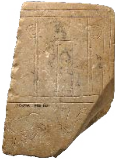
This limestone votive plaque shows a temple doorway flanked by posts with rings and, below, a procession of a sheep and a man holding a large cup, 2600-2500 BC, possibly Cutha, Iraq