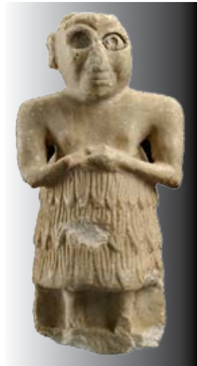
This Ancient Sumerian votive figure was found by soldiers digging trenches in WW1. The man is wearing a fleece skirt. His left eye retains an inlay of mother-of-pearl, while a headdress was originally fitted into the holes in the top of his head. 2500-2400 BC, Istabalat, Iraq.

Please contact us or visit our website for more information about our programmes including training opportunities