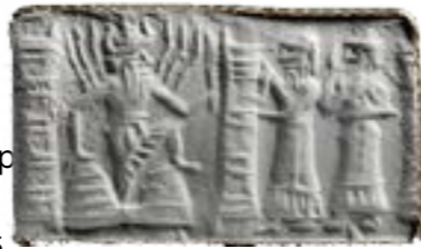
This is a modern impression from a Sumerian cylinder seal. It shows the sun god, Shamash, passing through the gates of heaven at dawn. Rays of light stream from his shoulders as he steps, sword in hand, between two mountains.

The door pivot was probably one of a pair which would have supported the main temple gate. Temple gateways were holy places. When the doors opened, the light of Shamash, god of the sun and justice shone into the temple. The two wooden doors would have been sheathed in precious metal, and because they were holy, they would have been annointed with wine and oils. This might also have lubricated the pivot-stone allowing the gates to open and close smoothly. The inscription records the building of a temple to Enki, god of fresh water and wisdom. It is possible that this object comes from Enki's main temple at Eridu. This idea is supported by the discovery of another stone block with a parallel inscription at Eridu in the late 1940s.