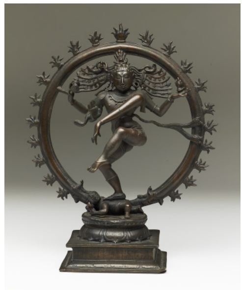
Shiva, Lord of the dance, tramples the demon of ignorance underfoot. On display in Gallery 32, India from AD 600.

Vishnu is the protector. Hindus believe that when the earth is in peril, he comes to protect it. He has nine different forms or avatars. Two of these appearances are more important than others. One is where he came to earth as Rama, a prince whose wife was captured by an evil demon. His adventures are told in the poem called the Ramayana. The other most famous appearance is as Krishna who is the hero of the Bhagavad Gita, part of a poem called the Mahabharata.