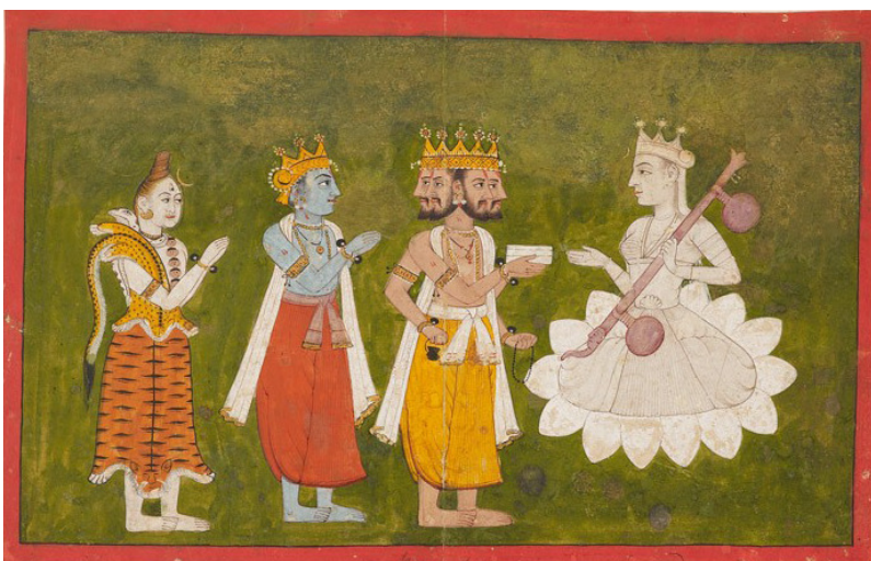
In this picture, Devi, the Great Goddess, whose powers incorporate those of the other gods, sits on a lotus playing the vina. She is attended by Brahma, Vishnu and Shiva, the three principal Hindu gods, who pay their respects. http://jameelcentre.ashmolean.org/collection/8/object/19118