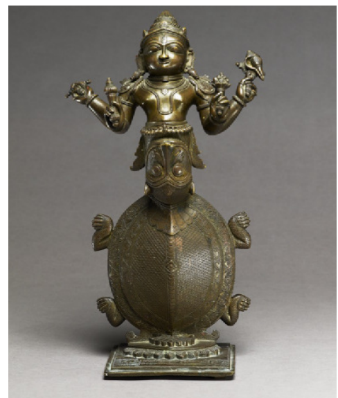
This small bronze statue is Kurma, the tortoise avatar of Vishnu.