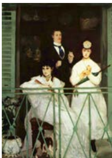
'Le Balcon' Edouard Manet, 1868