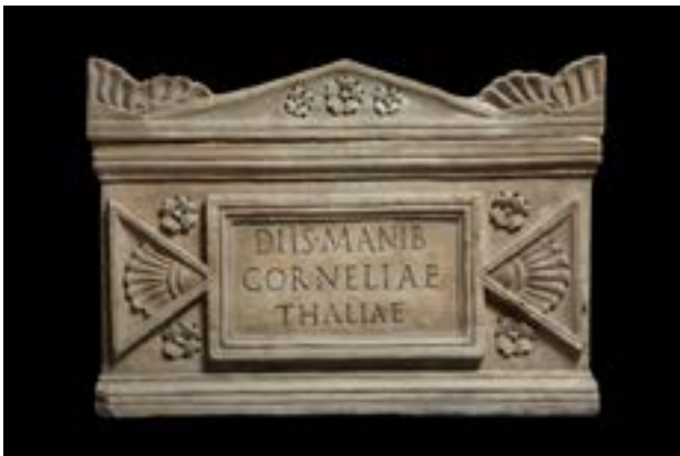
Urn of Cornelia Thalia, Rome, about AD50-70. The urn is decorated as a miniature shrine. The Latin text is dedicated to the departed spirits of the deceased women, whose cremated remains were kept in it. No image or personal details are given. AN2007.63