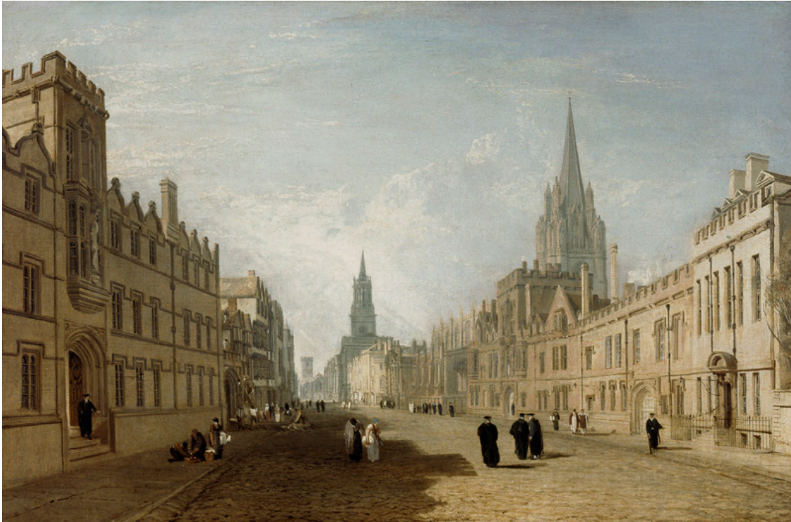
View of the High Street, Oxford, Joseph Mallord William Turner (1775-1851), 1810 L1197.4 oil on canvas

Objects and artworks at The Ashmolean show how the use of perspective in art has changed and developed across different cultures and times.