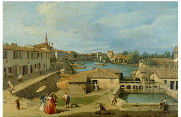
View of the Dolo on the Brenta Canal, Giovanni Antonio Canal, called Canaletto (1697-1768) oil on canvas WA 1855.187 Gallery 49: Britain and Italy